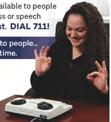
New York Relay Service is funded by New York's Telecommunications Carriers.